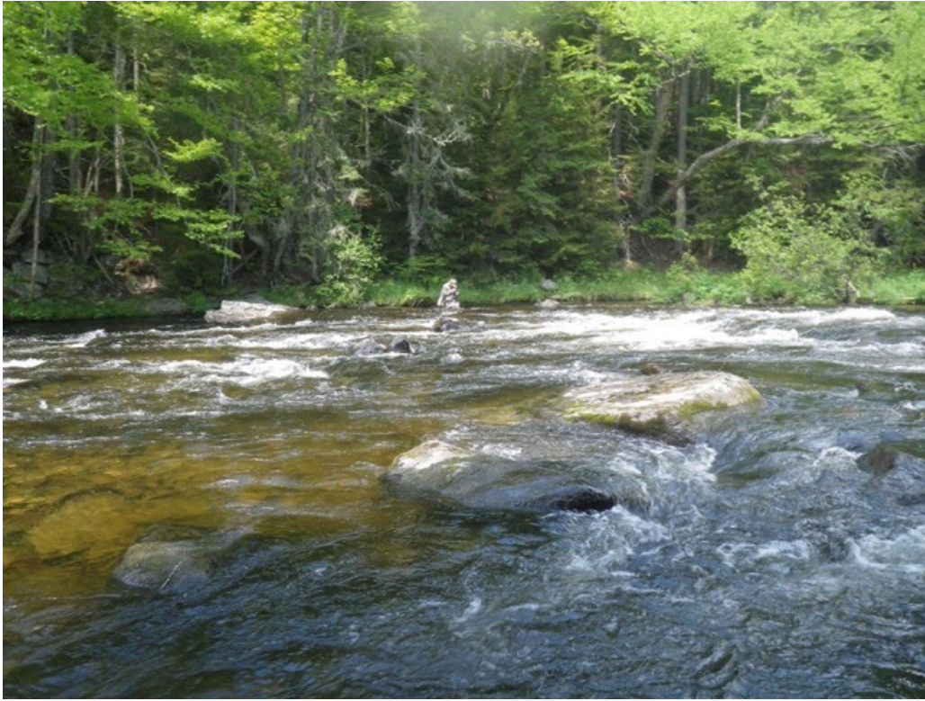
Kalil Boghdan re-rigging on a typical stretch of water on the upper Connecticut River. This is a fine example of the four mile stretch from the First Connecticut Lake to Lake Francis.